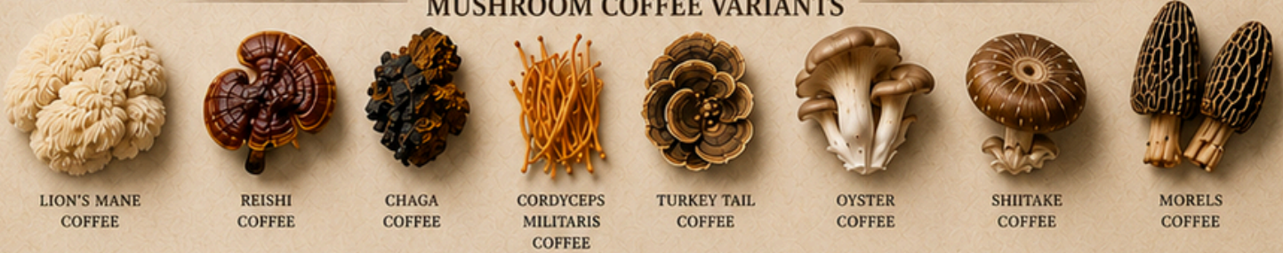
LION'S MANE COFFEE