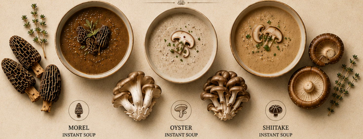
MOREL INSTANT SOUP