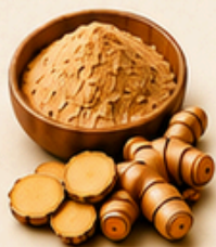
Mango Ginger ( Amba Haldi )