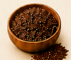
Perilla Seeds ( Bhangjeera )