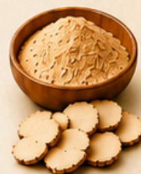
White Turmeric ( Curcuma zedoaria )