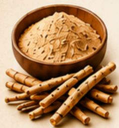
Ashwagandha Root – Whole, Cut, Powder

Carefully sourced raw herbs and natural powders for health, wellness and everyday vitality.