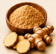
Ginger Root – Dried, Powder