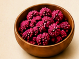
Gorakmundi ( Sphaeranthus indicus ) Freeze Dried / Sun Dried