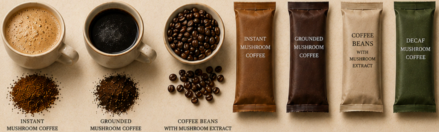
INSTANT MUSHROOM COFFEE

☞ COFFEE USED: 100% FREEZE-DRIED ARABICA EXTRACT