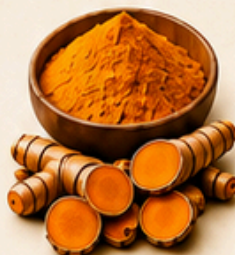
Lakadong Turmeric (7–12% Curcumin)