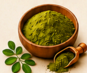
Moringa Leaf Powder