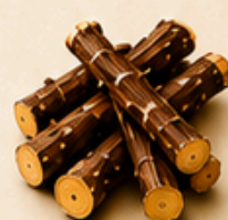
Licorice ( Mulethi )