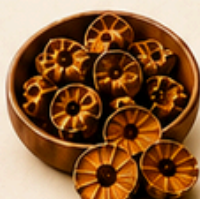
Amla – Dried Fruit, Powder