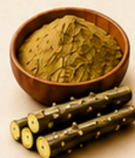
Giloy Stem – Whole, Powder