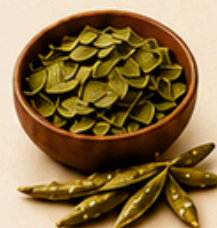
Senna Leaves & Pods