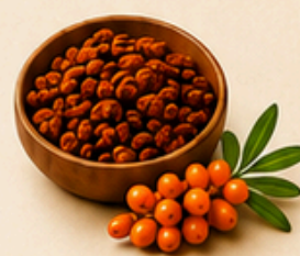
Seabuckthorn Berries (Dried)

SOURCED WITH CARE. DELIVERED WITH TRUST.