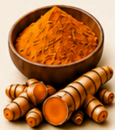
Turmeric Root – Whole, Cut, Powder